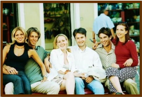
Couples are waiting for your coaching.